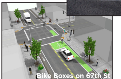
Bike Boxes on 67th St