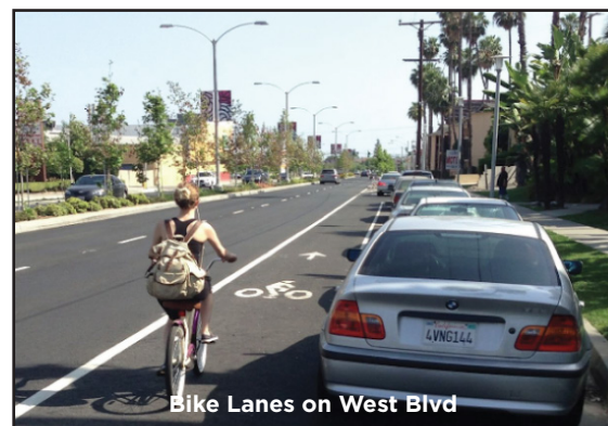
Bike Lanes on West Blvd