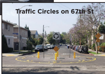
Traffic Circles on 67th St