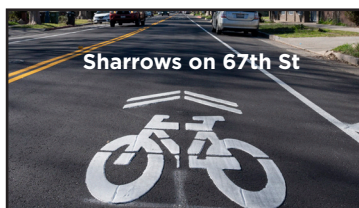
Sharrows on 67th St