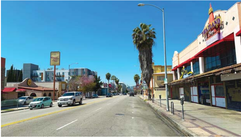
Hollywood Blvd looking west at Hobart Blvd

To address the safety needs on Hollywood Blvd, LADOT will implement a new street design between Gower St and Lyman Pl that will reduce excessive speeds, reduce pedestrian exposure, provide for safer turns, and create dedicated space for people on bikes and scooters.