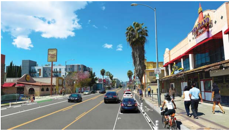
Illustrative, does not represent final design